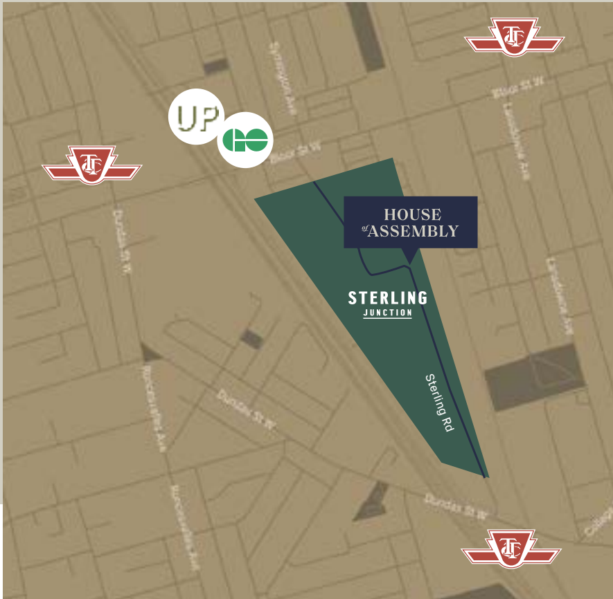
At Sterling Junction

GO Train The Bloor GO Station at Dundas and Bloor links you to the westbound Kitchener Go Train. The Future station at Bloor and Lansdowne will serve northbound connections through to Barrie. 5-Minute Walk