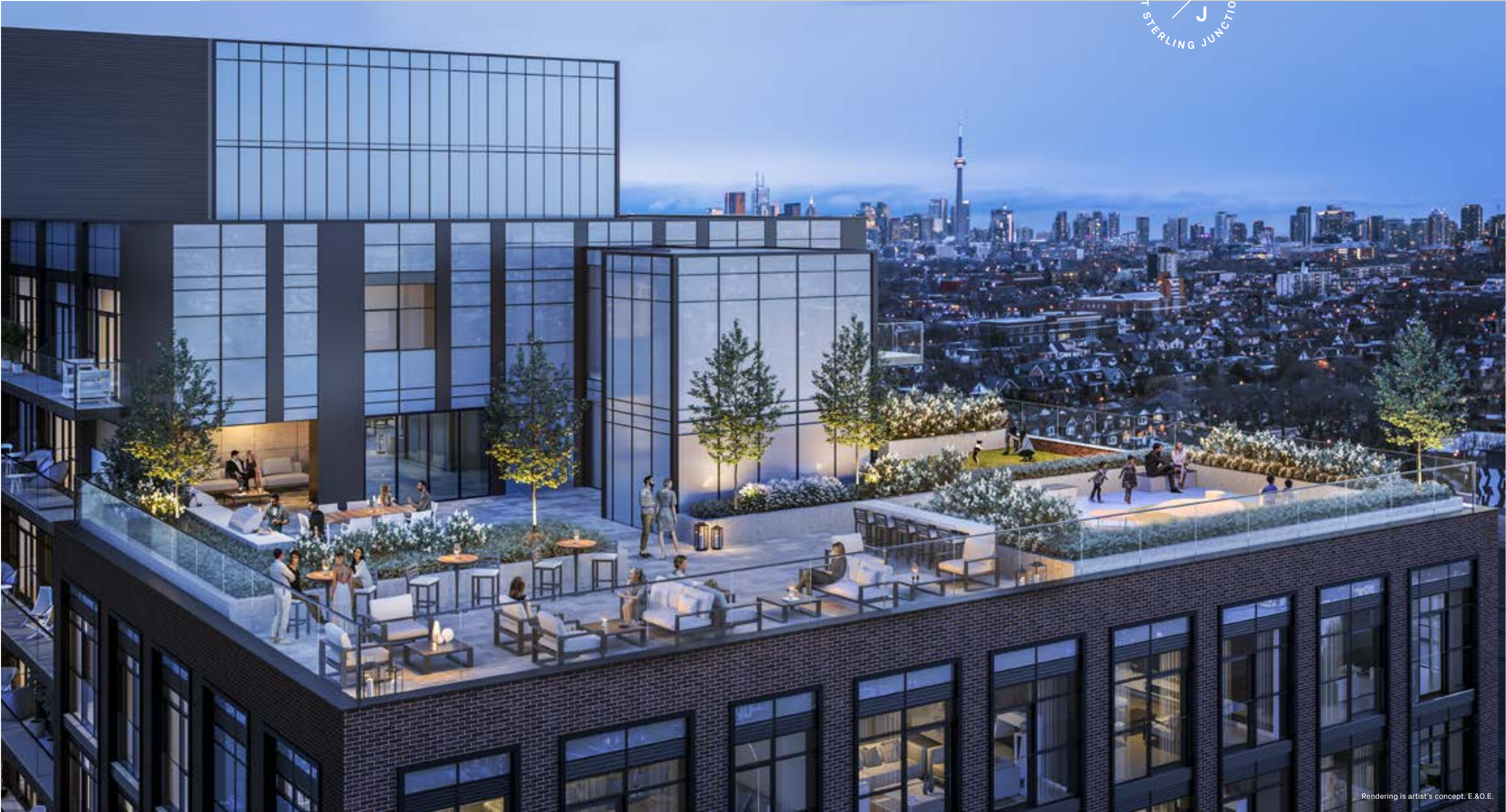
Rendering is artist's concept. E.&O.E.