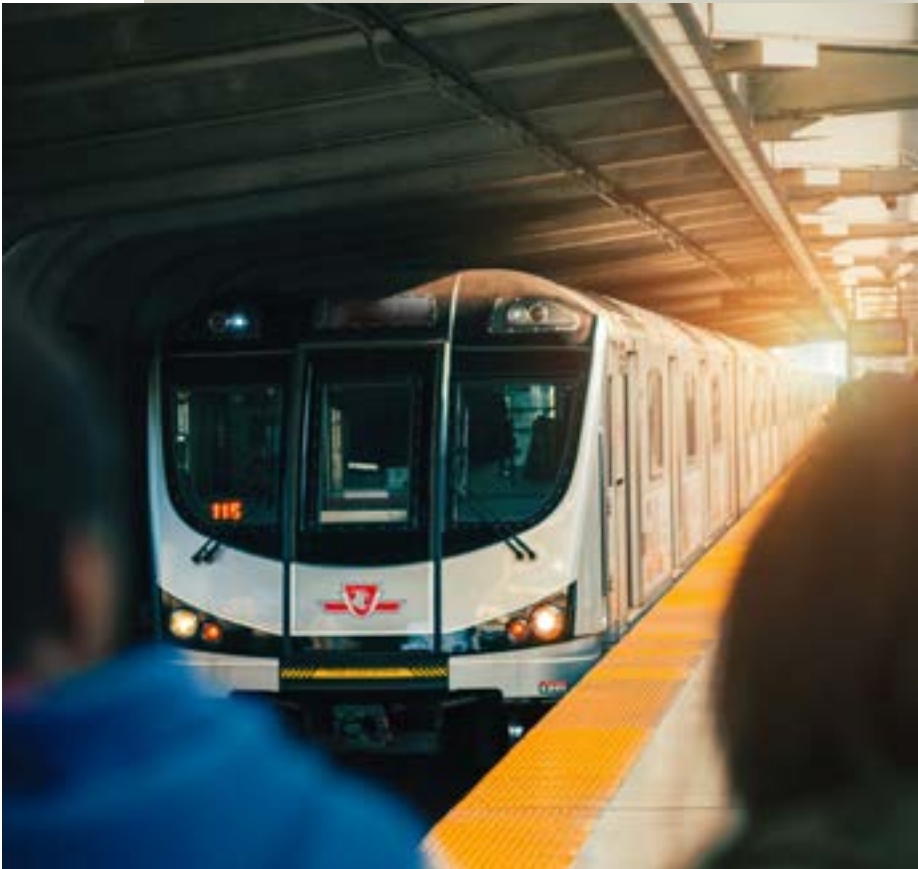
House of Assembly

Subways Conveniently located within walking distance, the Bloor Line 2 subway stations at Dundas West Station and Lansdowne Station offer a quick connection to downtown. 8-Minute Walk