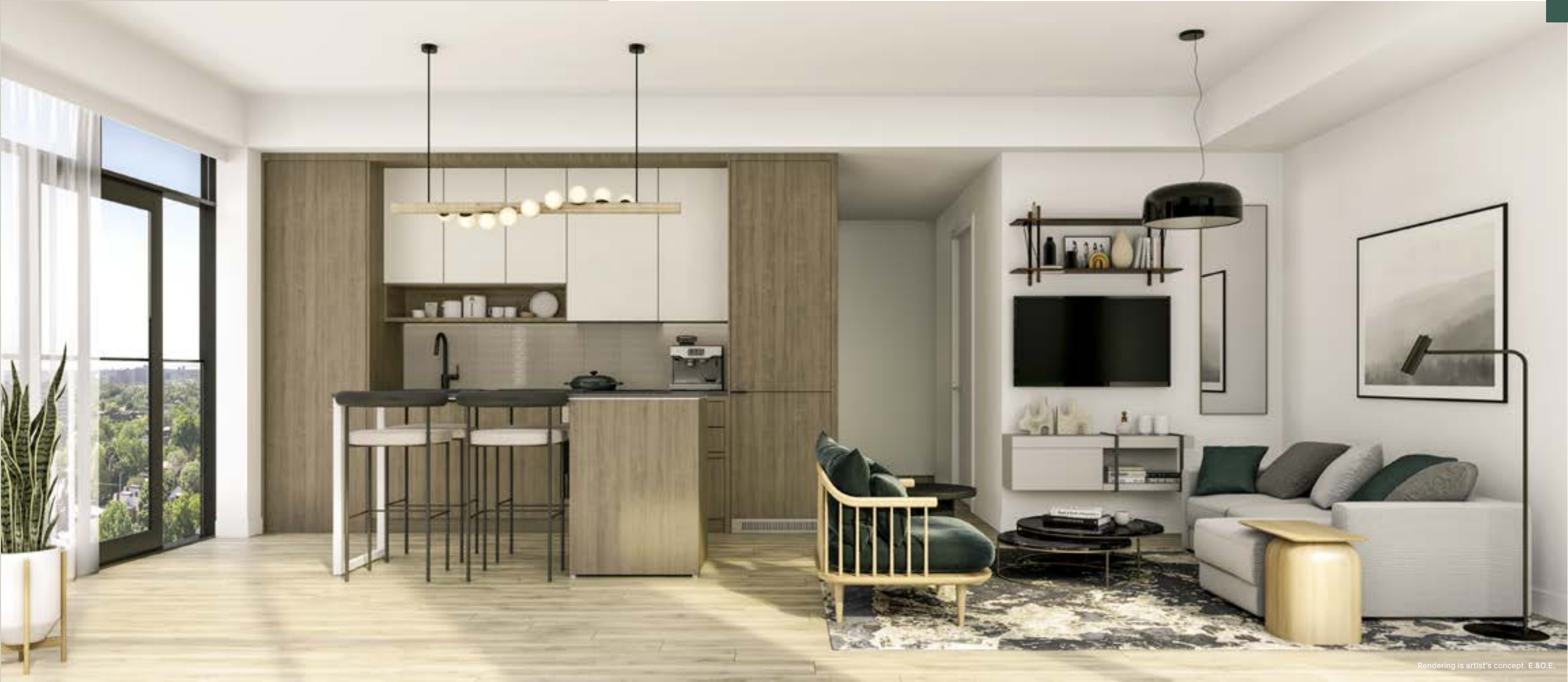
Rendering is artist's concept. E.&O.E.

Comfortable, open-concept design, highlighted with floor-to-ceiling windows that bathe your home in natural light and stunning views, paired with exceptional finishes and inspired design, make House of Assembly the ideal address for urbanites seeking the perfect balance between sophistication and cozy living.