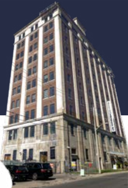
House of Assembly